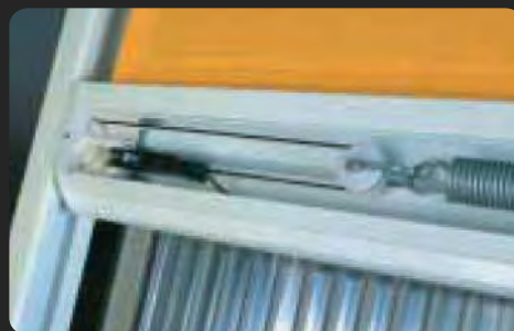
The fabric and the front rail are kept under constant tension by way of a spring, wheel-runners and the Hi-Tech cord.