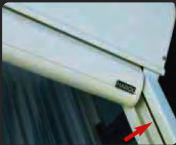
The Hi-Tech Cord - developed specially for this product guarantees a long life for your conservatory awning.

Harol Conservatory awnings when rolled up the fabric is completely inside the VZ box, protected against any effects of the weather outside. The VZ is fixed to the guide rails, which are fastened to the conservatory frame by means of fastening supports.