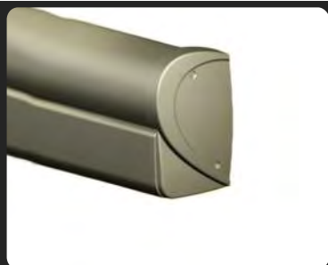
Low Profile Cassette