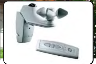
Optional Sun and Wind Sensor

The BX260 is a compact and relatively flat cassette awning designed and engineered with aesthetics and function in mind. Attention to technical detail ensures years of trouble free operation.